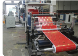
3. Hot Stamping