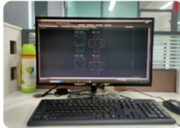
1. Structural Design