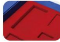
Velvet with EVA

ShenZhen XiangLong Paper Product & Packaging Co., Ltd. our production categories include high-end gift box, folding box, cosmetic box, paper bag ,card box ,cylinder ,poster and paper book ,etc.