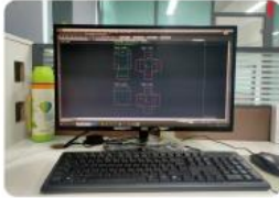
1. Structural Design