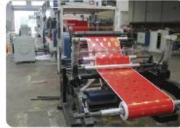
3. Hot Stamping