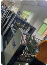
7. Stick Box