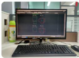
1. Structural Design