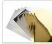
Gold and Silver Cardboard