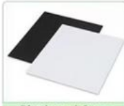
Black and Grey cardboard

Eco-Friendly Concepts on Every Sheet of Paper — FSC Certified 100% Recyclable.