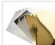
Gold and Silver Cardboard