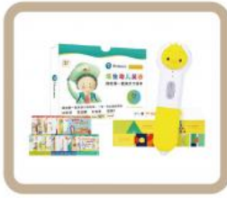
01 | Memory Book