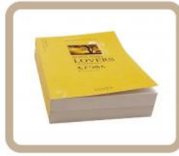
02 | Softcover Book