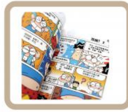
03 | Comic Book