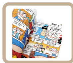
03 | Comic Book