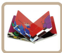
04 | Board Book