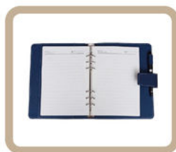
05 | Notebook