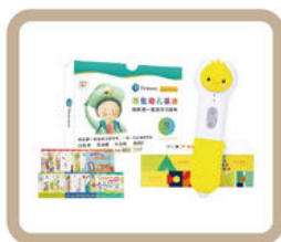
01 | Memory Book