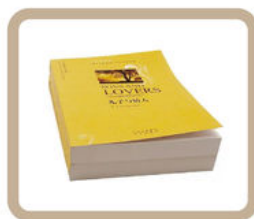
02 | Softcover Book