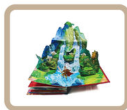
06 | 3D Book