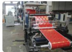
3. Hot Stamping