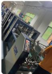
7. Stick Box