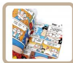
03 | Comic Book