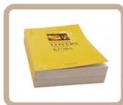
02 | Softcover Book