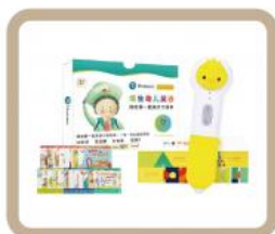
01 | Memory Book