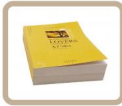
02 | Softcover Book