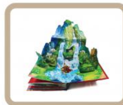
06 | 3D Book