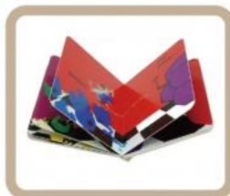
04 | Board Book