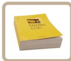
02 | Softcover Book