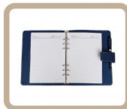
05 | Notebook