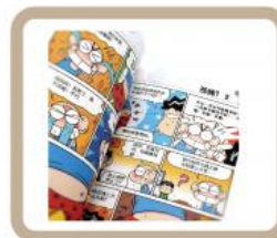
03 | Comic Book