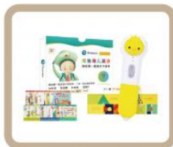
01 | Memory Book