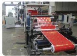
3. Hot Stamping