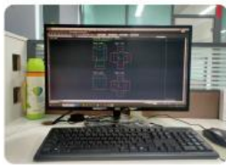
1. Structural Design