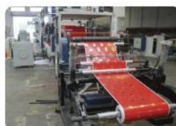
3. Hot Stamping