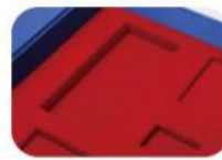
Velvet with EVA