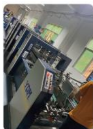
7. Stick Box