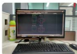
1. Structural Design