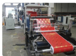
3. Hot Stamping