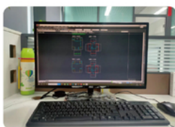
1. Structural Design