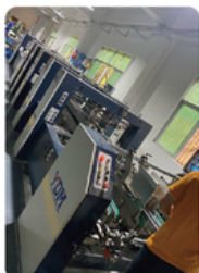
7. Stick Box