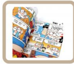
03 | Comic Book