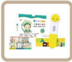
01 | Memory Book