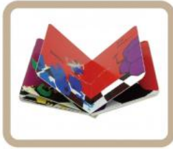
04 | Board Book