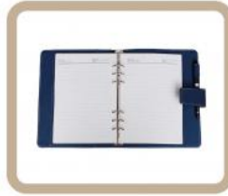
05 | Notebook