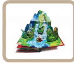
06 | 3D Book