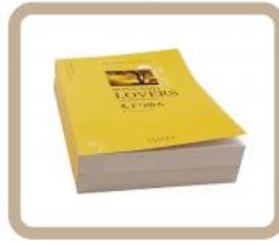
02 | Softcover Book