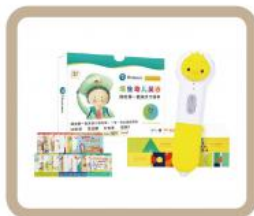
01 | Memory Book