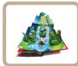
06 | 3D Book