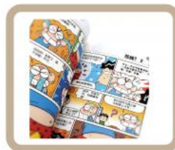
03 | Comic Book