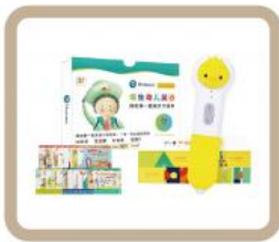
01 Memory Book