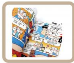
03 Comic Book