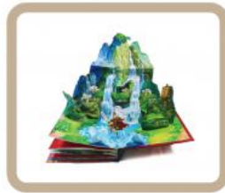
06 3D Book