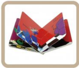
04 Board Book