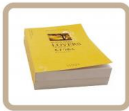
02 Softcover Book