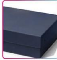
Soft Touch Laminate