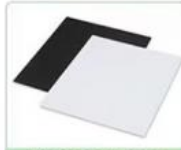
Black and Grey cardboard

Eco-Friendly Concepts on Every Sheet of Paper — FSC Certified 100% Recyclable.