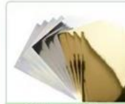
Gold and Silver Cardboard