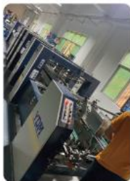
7. Stick Box