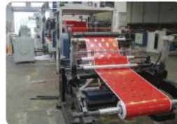
3. Hot Stamping