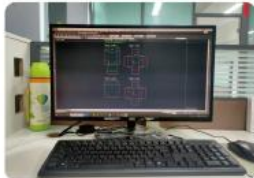
1. Structural Design