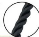
Nylon Twisted Rope