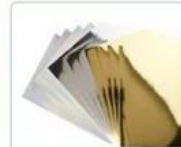
Gold and Silver Cardboard