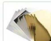
Gold and Silver Cardboard