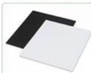
Black and Grey cardboard

Eco-Friendly Concepts on Every Sheet of Paper—FSC Certified 100% Recyclable.