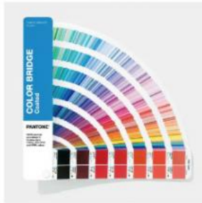
Surface Paper you can choose

Blue Red yellow Black ( Be used for the printing of varied colors )