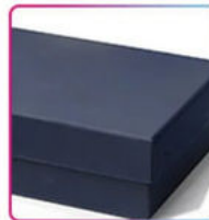
Soft Touch Laminate