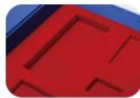
Velvet with EVA