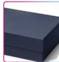
Soft Touch Laminate